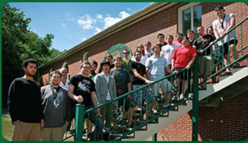
All proceeds from the sale of this recording benefit the NSU Jazz Studies Program, its public performances, tours, and recordings.

©2012 Northeastern State University Jazz Studies > All Rights Reserved FBI Anti-Piracy Warning: Unauthorized duplication is punishable under federal law